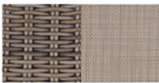
Driftwood wicker/Taupe sling: DPE