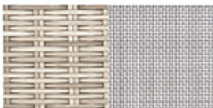
Shadow wicker/Gray sling: SWG