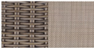
Driftwood wicker/Taupe sling: DPE